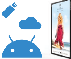
INTEGRATED ANDROID MEDIA PLAYER