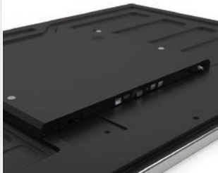
CONNECT EXTERNAL DEVICES